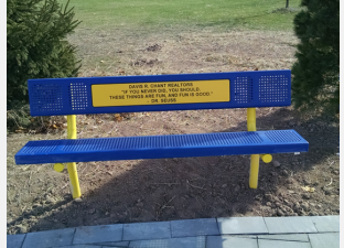
Metal w/Vinyl Coating