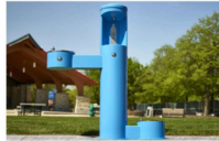
DRINKING FOUNTAIN W/ BOTTLE REFILL