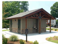
RESTROOM W/ DRINKING FOUNTAIN