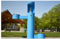
DRINKING FOUNTAIN W/ BOTTLE REFILL