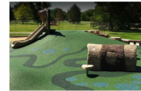
NATURE PLAY ELEMENTS WITH COLORFUL RUBBER SURFACING