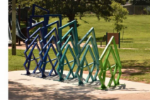
DECORATIVE BIKE RACKS