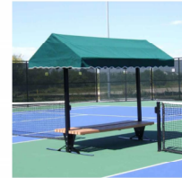
PICKLE BALL COURTS BENCH WITH SHADE