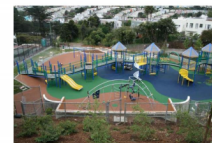
UNIVERSAL PLAY WITH COLORFUL RUBBER SURFACING