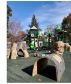
NATURE PLAY THEME PLAYGROUND